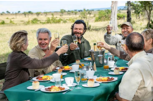
ACCOMMODATION: KATI KATI TENTED CAMP - Breakfast, Lunch & Dinner